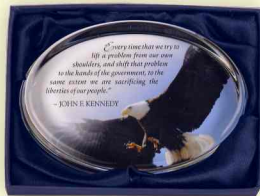
CPS0103 JFK Eagle Paperweight