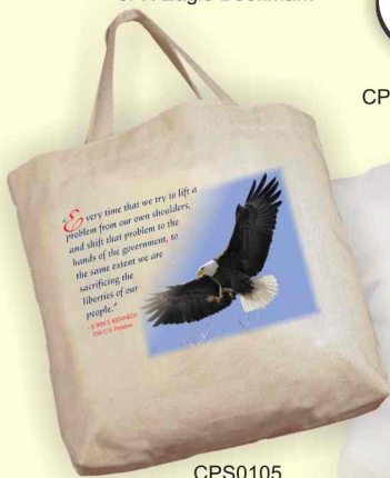
CPS0105 JFK Eagle Tote