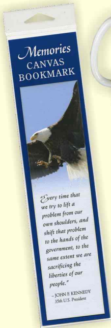
CPS0101 JFK Eagle Bookmark

Products with a message! All hand-decorated in Virginia!