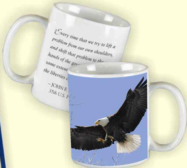
CPS0102 JFK Eagle Mug