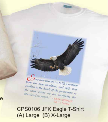
CPS0106 JFK Eagle T-Shirt (A) Large (B) X-Large