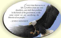
CPS0104 JFK Eagle Magnet